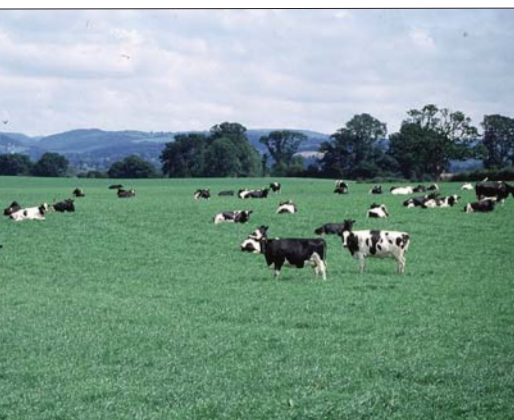
Dairy cattle grazing on high-sugar grass in Wales, United Kingdom.

Improved microbial activity improves feed-to-milk protein conversion